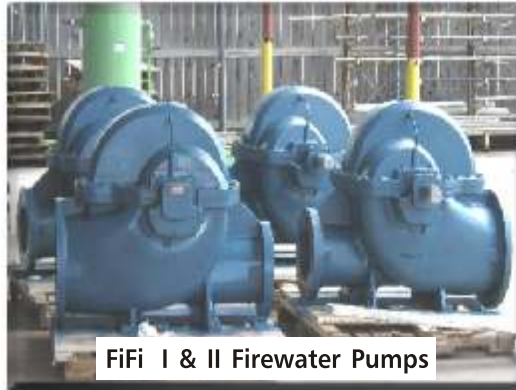
FiFi I & II Firewater Pumps