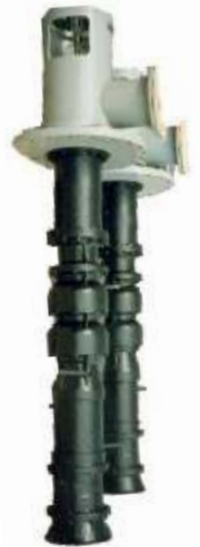
Custom Barge Vertical Turbine Pumps All stainless steel All Bronze construction Cast Iron / Bronze trim