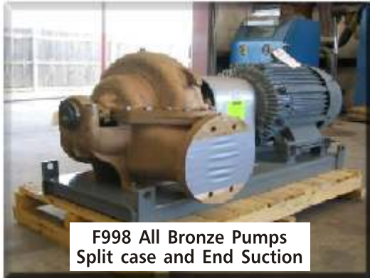
F998 All Bronze Pumps Split case and End Suction

Sewage Transfer Pumps Cooling Water Pumps De-watering Pumps Cargo Transfer Pumps Oil, Water, Fuel and Mud Barge Pumps Vertical Bilge and Ballast Vertical Cooling water Vertical Cargo Stripper Pumps