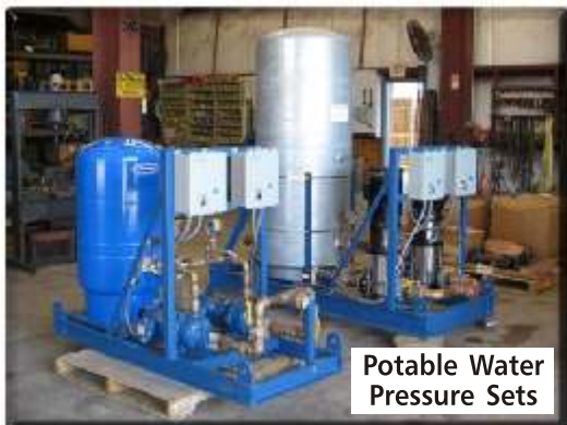
Potable Water Pressure Sets