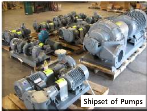
Shipset of Pumps