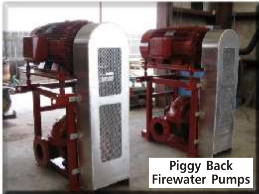
Piggy Back Firewater Pumps