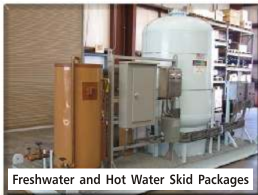
Freshwater and Hot Water Skid Packages